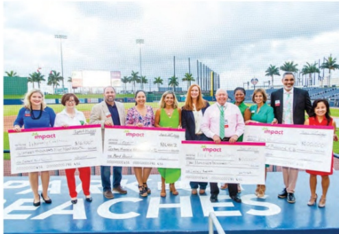
The 2022 Impact the Palm Beaches' Impact Grant winners

For more information about Impact the Palm Beaches and how to become a member, visit ImpactPalmBeaches.org .